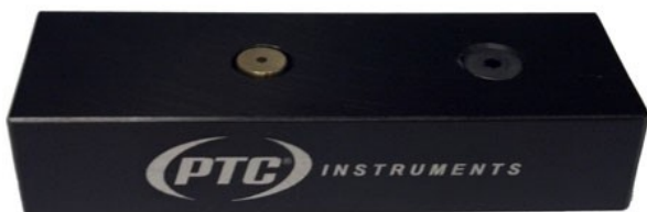
Aluminum Test Block

All durometers come complete with an aluminum test block and carrying case. The test blocks are color coded to match durometer type. The blocks will read within \pm 2 points of a properly functioning durometer.