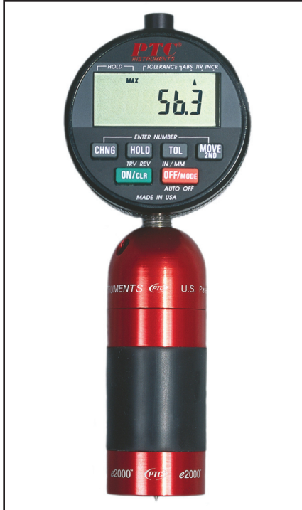
Model 512D Digital ASTM Type D Durometer for plastics, hard rubber, epoxies, etc.

The ultimate durometer for accurate hand held hardness measurements. PTC® leads you into the new millennium with this durometer's refined styling. The durometer is easy to grip and the 1.25" diameter base has a large landing area for increased stability and maximum repeatability.