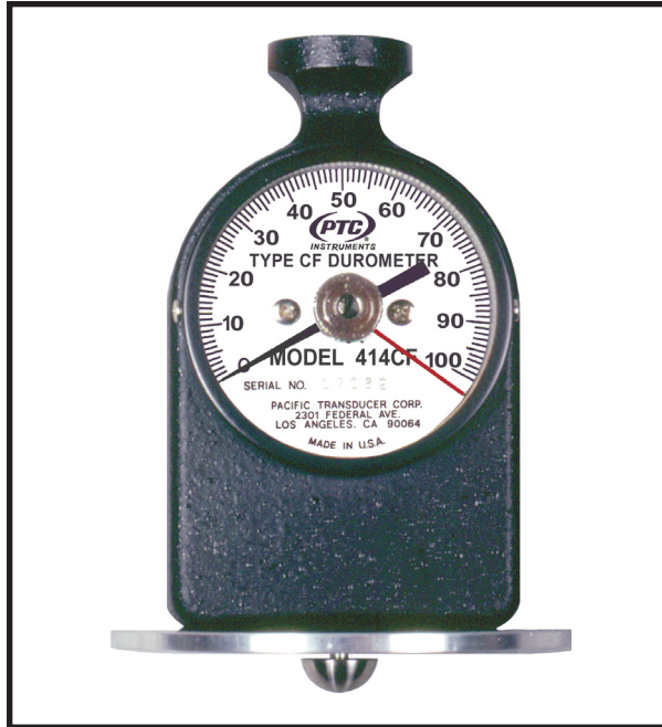
Model 414CF Type CF Durometer for Molded Foams

PTC's Model 414CF Type CF Durometer measures hardness of all generations of foam products: Freon blown types, water blown types, and new composite foams.