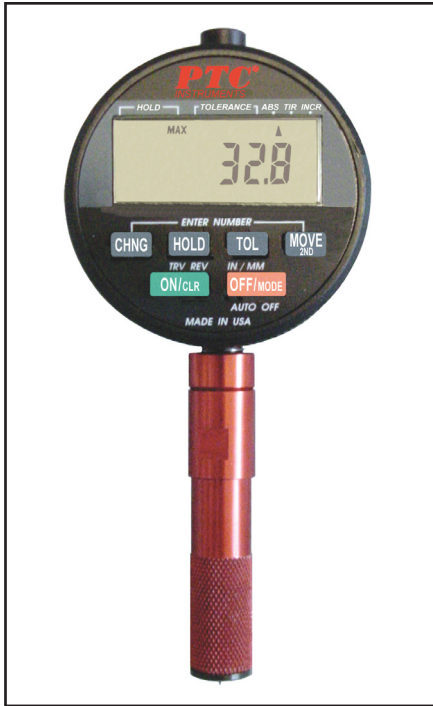
Model 212 Digital ASTM Type D Durometer for plastics, hard rubber, epoxies, etc.

Each digital durometer comes with a calibration certificate to NIST. The durometer's 1/2" diameter base is the smallest base permitted by ASTM D2240 Specifications. This allows it to be used in confined or hard to reach areas other durometers cannot test. A knurled surface gives a more secure gripping area when making hand held readings. These durometers meet or exceed all aspects of ASTM D2240.