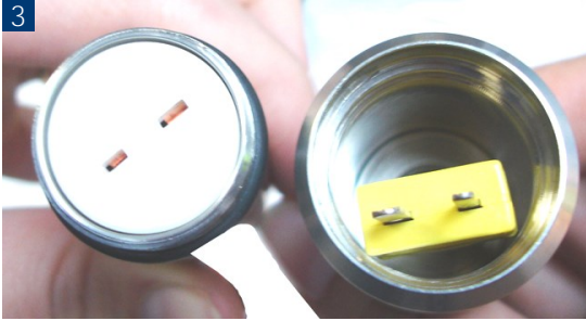
Figure 2 – Female mini plug (left) and male mini plug (right).

Disconnect the male mini plug that is connected to the data logger body (see figure 5).