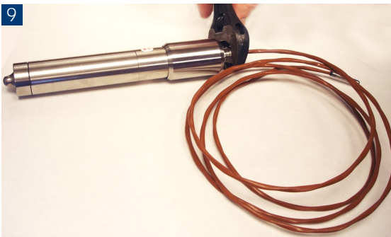
Figure 8 – Tightening the cable gland nut.

Screw the thermo cover onto the data logger body so the o-ring is no longer visible.