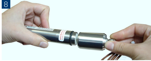
Figure 7 – Make sure to screw the enclosure together tightly.

Connect the male mini plug to the female mini plug on the data logger body. Thermocouples are polarity sensitive, so there is only one way to insert the mini plug into the thermocouple input on the TCTemp1000.