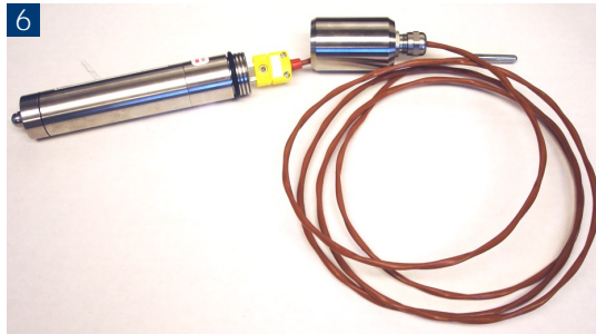
Figure 5 – Slide the new thermocouple sheath-first.

Pull the thermocouple out of the thermo cover by the mini plug end, ensuring the thermocouple sheath passes through the cable gland (note that sheath diameters larger than 3/16" are not recommended ), and then discard the old or faulty thermocouple.