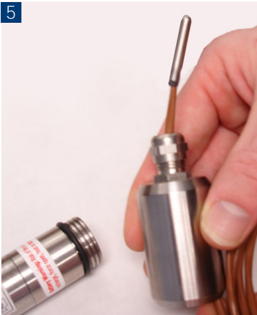
Figure 4 – Pull the thermocouple out of the thermo cover.

Once the thermo cover is removed and the male mini plug is disconnected, loosen the cable gland nut to pull the old thermocouple out of the thermo cover.