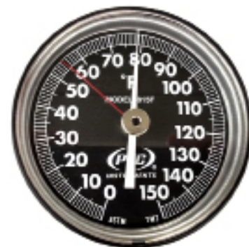
815F with Reference Pointer

Accessory: Desk Stand (Part) number 815.5