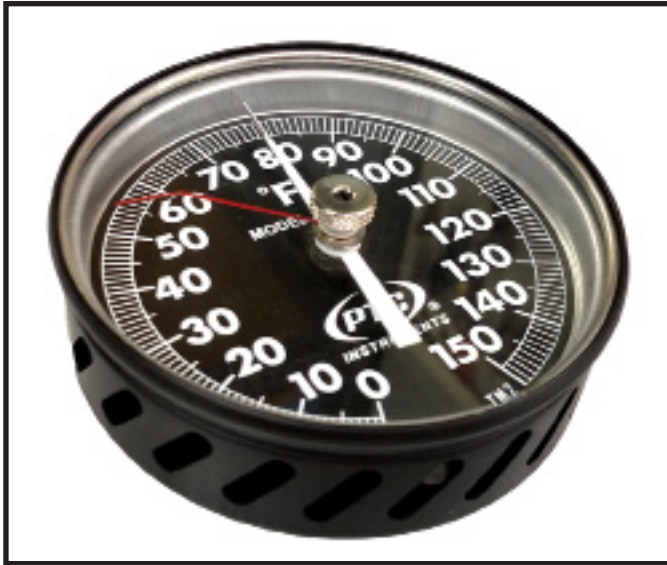
Air immersion wall thermometer with lazy hand 815FL Shown above