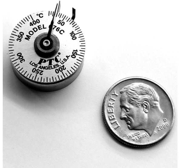
Model 676C Miniature Spot Check ® Surface Thermometer Shown Twice Actual Size