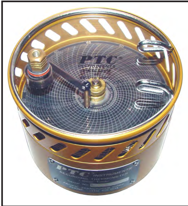
Model 618 Time-Temperature Oven Recording Thermometer