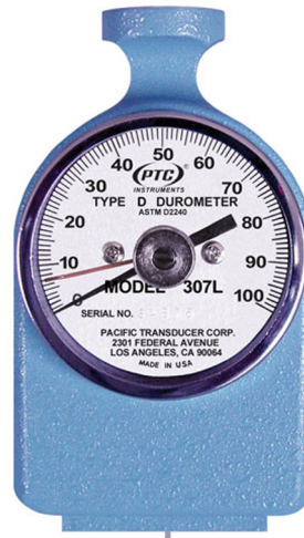
Classic Style Durometer