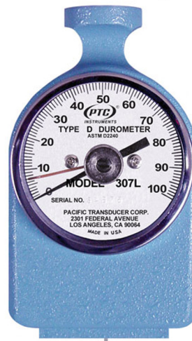
Classic Style Durometer