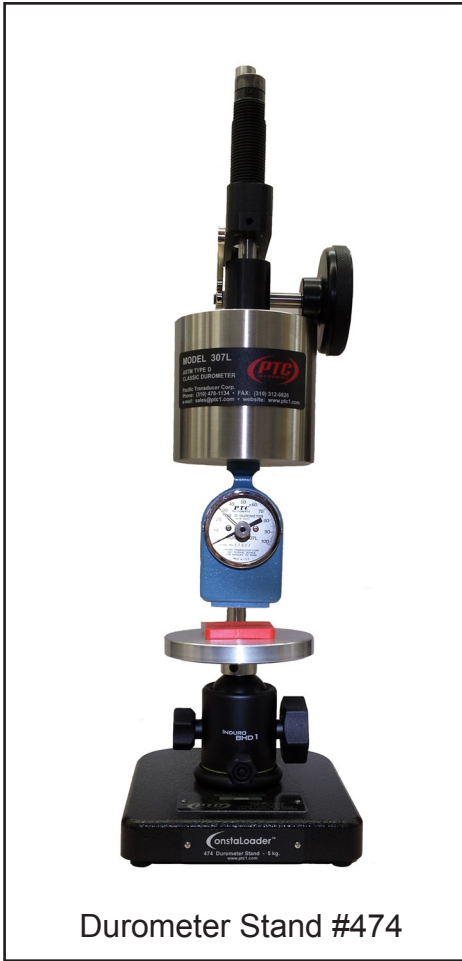
Durometer Stand #474