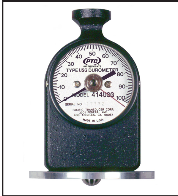
Model 414USG Durometer for drywall sheets

PTC®'s Model 414USG Durometer measures hardness of drywall sheets during processing. Drywall can be checked for proper curing before the cutting stage.