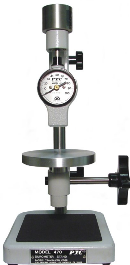
Durometer Stand Model 470

Other durometer types, custom models and durometers from other manufacturers can also be certified by PTC Metrology™.