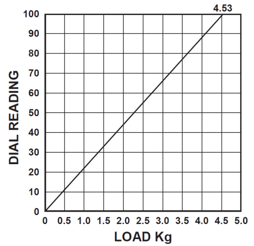
Force curve for Model 409 (ASTM D2240 Type D)

Place the specimen on a hard, horizontal surface. Set the ancillary hand of the durometer below 5 points on the dial. Hold the durometer vertically with the point of the indenter at least 1/2" from any edge. Apply the presser foot to the specimen as rapidly as possible, without shock, keeping the foot parallel to the surface of the specimen. Apply just sufficient force to obtain firm contact between the presser foot and the specimen. Hold for 1 or 2 seconds, the maximum reading can be obtained from the ancillary hand. If other than a maximum reading is needed, hold the durometer in place without motion and obtain the reading after the required time interval. Make 5 tests at least 1/4" apart and use the average value.