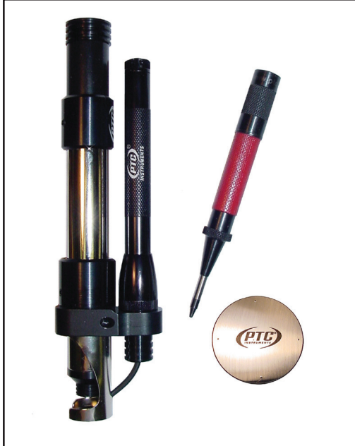
Model 316 shown above