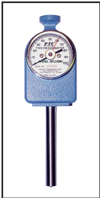
Model 307LCRBIV Durometer for measuring shell hardness of Dungeness crabs

This durometer was developed to help the Canadian Department of Fisheries and Oceans limit the percentage of soft shell snow crabs in a fisherman’s catch. By checking the hardness of the claw, recently molted (soft) crabs with low meat yield can be avoided.