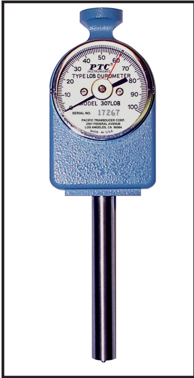
Model 307LOB Durometer for determining lobster shell hardness