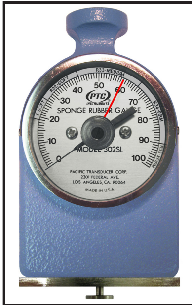
Model 302SL Durometer for foam and sponge rubber

The Model 302SL is a hand-held foam and sponge rubber hardness tester made exclusively by PTC® Instruments. The instrument has the capability to economically test the same type of material checked with an ILD tester. There is no direct conversion from the 302SL scale to ILD readings, however, the 302SL can be used for comparative testing.