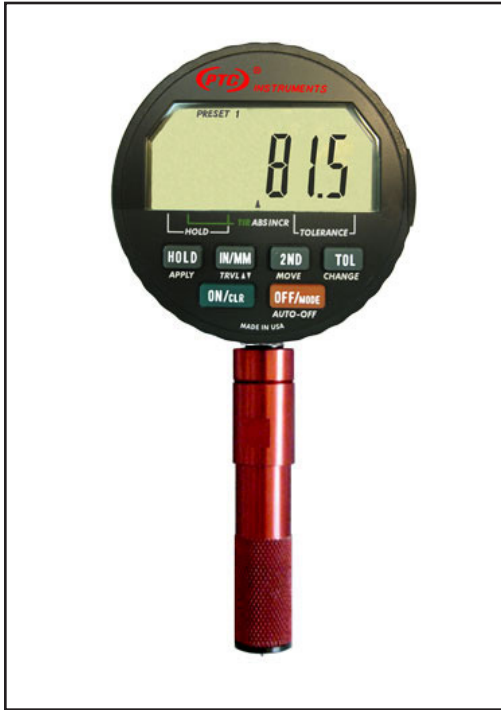
Model 212 Digital ASTM Type D Durometer for plastics, hard rubber, epoxies, etc.

Each digital durometer comes with a calibration certificate to NIST. The durometer's 1/2" diameter base is the smallest base permitted by ASTM D2240 Specifications. This allows it to be used in confined or hard to reach areas other durometers cannot test. A knurled surface gives a more secure gripping area when making hand held readings. These durometers meet or exceed all aspects of ASTM D2240.